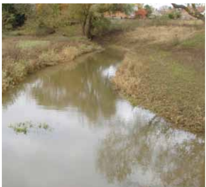
The backwater channel during high water flows.

Delivered by: Environment Agency Partners: Water Framework Directive funding via the Great Ouse Wetland Vision