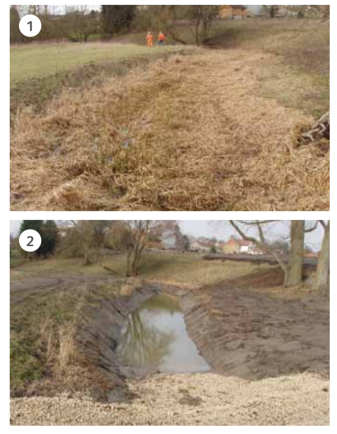
(1) Backwater channel prior to restoration works(2) Backwater channel post restoration works

This created a suitable refuge area for fish to use during high flow conditions in the main river. The project also created a ford, a sheep drinking area and included reseeding of a small woodland area with native woodland plant species.